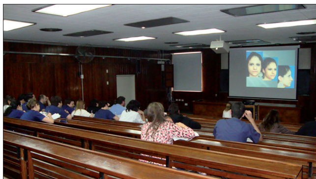
Figure 4. Photograph of evaluation period; note slide projection and evaluator note taking.

The aim of this study was to evaluate data and verify significant differences between scores before and after the surgery.