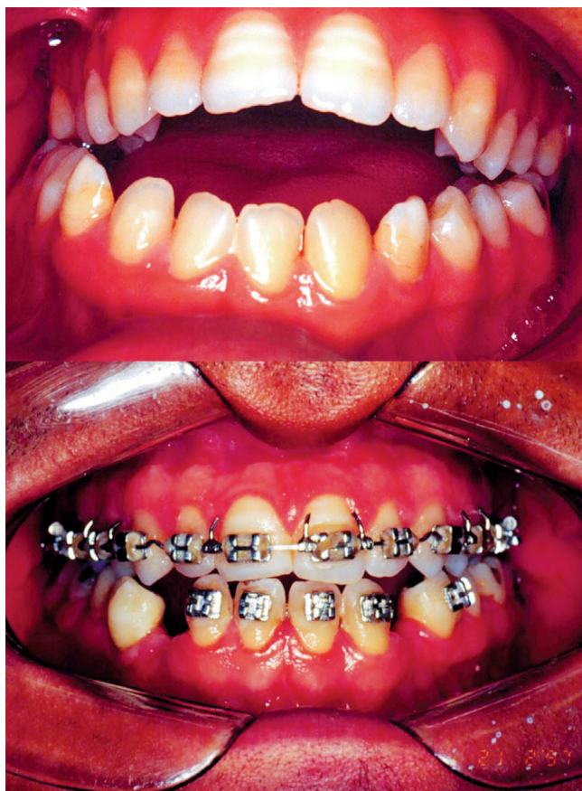
Figure 2. Aspect of pre-and postoperatively with emphasis on dental occlusion.