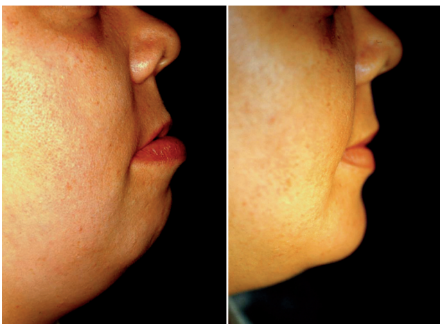
Figure 3. Angle of the neck in pre-and postoperatively.