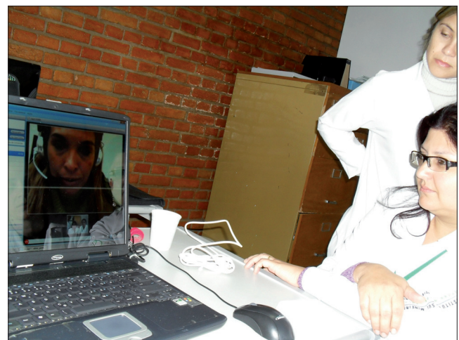
Figure 3. SU audiologist on the RU screen.