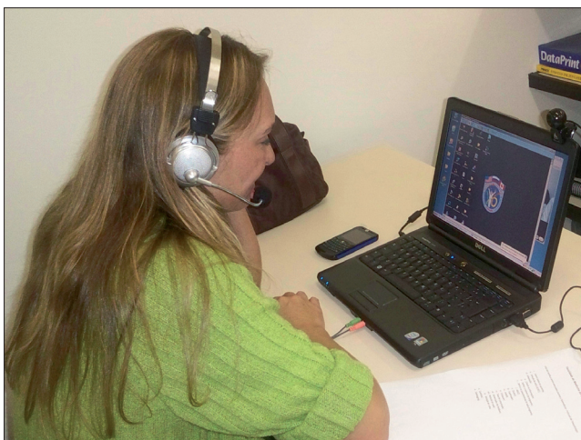
Figure 2. SU Audiologist.