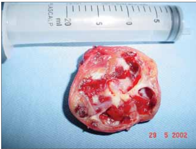
Figure 3. Surgical specimen with a solid nodule with a cystic component, vegetated, heterogeneous aspect and pinkish, yellowish, with areas of fibrosis, hemorrhagic foci with well-defined margins, thick capsule without invasion and extratireoidiana fibroelastic consistency. The diagnosis was goiter with cystic degeneration.