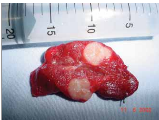
Figure 1. Surgical specimen showing solid nodule of whitish and homogeneous aspect, without hemorrhagic or necrotic foci with poorly defined margins, no capsular invasion extratireoidiana and firm consistency. The diagnosis was papillary carcinoma.

The histopathological diagnosis of paraffin embedded material was available for each nodule studied. The macroscopic characteristics of the nodules were compared to the results of pathology.