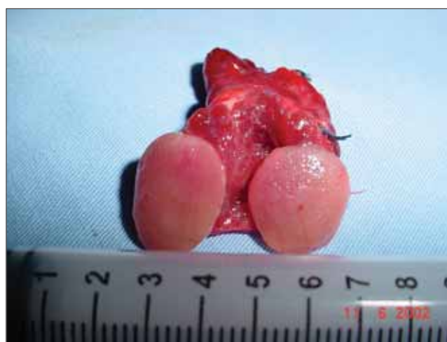
Figure 2. Surgical specimen showing solid nodule of homogeneous aspect and pinkish, without hemorrhagic or necrotic foci with well-defined margins, with thin capsule without invasion extratireoidiana and elastic consistency. Freezing and paraffin showed follicular neoplasm, follicular adenoma.