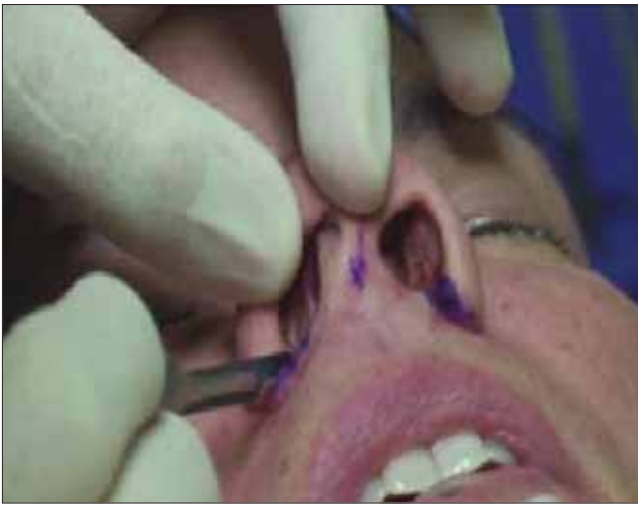
Figure 13. Step 3.