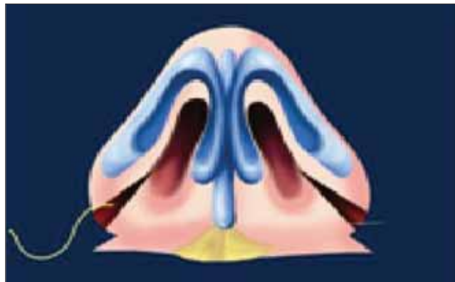
Figure 6. With needle straight and colorless mononylon® 4-0, the procedure is the introduction of the needle on the rim side to the contralateral medial edge.