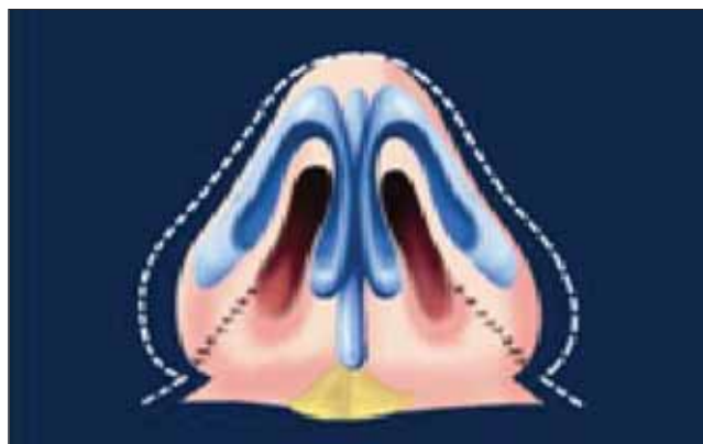
Figure 10. Finally, close to the skin with mononylon ® 5.0. Note: The sequence is repeated in the contralateral nostril, as described by Gruber (3), 2009.