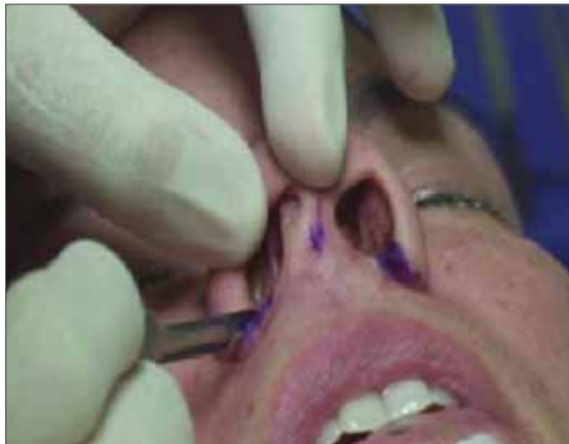
Figure 3. Technical Weir changed.