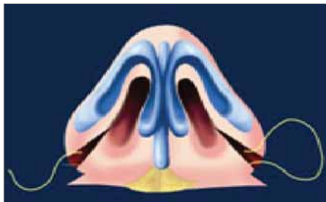
Figures 7 and 8. Returns in reverse, ie the lateral edge to the medial edge.