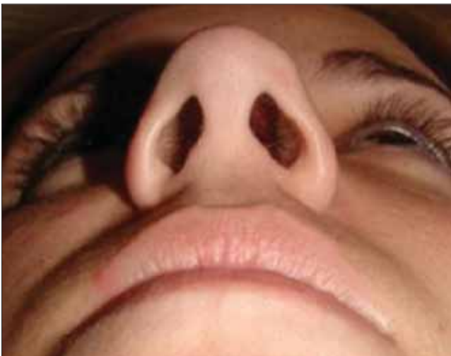
Figure 15. Pre operative view basis.