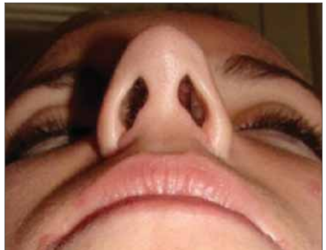
Figure 16. Post-operative view of the base.