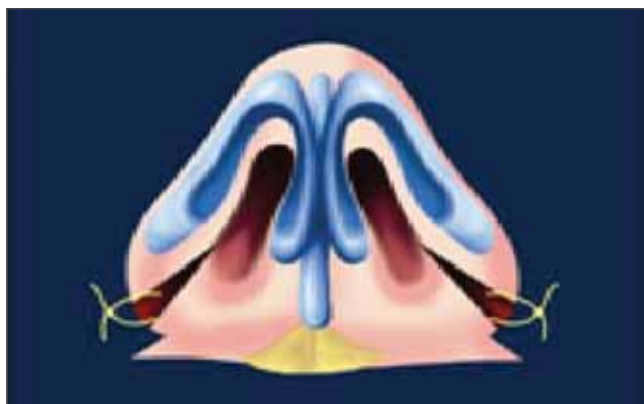
Figure 9. The suture is performed in both senses, ie from right to left and left to right.