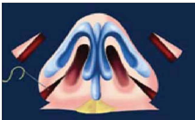
Figure 5. Resection of the skin of the vestibule and narinário ridge above the nasolabial groove.