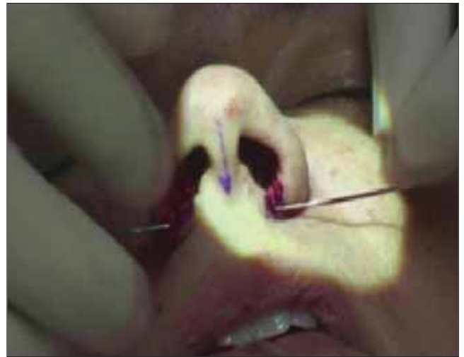
Figure 14. Step 4.