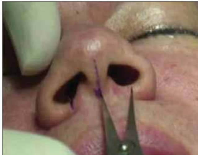
Figure 4. Dial with compass.