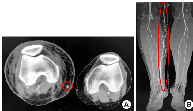
Fig. 1. Early venous return. (A, B) Computed tomography angiography showing early venous return. The red circle is the great saphenous vein. The images show observations in the arterial phase.