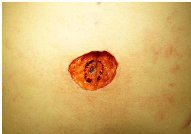
Fig. 2. Intraoperative image. Intraoperative defect after sacrifice of the umbilicus.