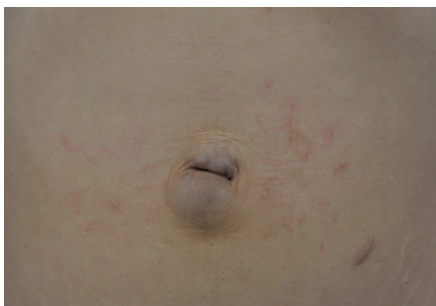
Fig. 1. Preoperative image. Preoperative view of the abdominal wall with two large masses on the umbilicus.

A 49-year-old woman was admitted to the hospital with a large, protruding, and severely distorted umbilical mass with an abnormal shape (Fig. 1). The patient had undergone laparoscopic uterine myomectomy 5 years prior, after which a mass was discovered around the umbilicus. A visual examination found two large masses above and below the umbilicus, which resulted in stenosis of the umbilical stalk. We performed computed tomography scan in order to rule out the possibility of connections to internal organs and found a mass measuring 5.8 \times 4.0 cm. There were no abnormal anatomical structures. We planned umbilical reconstruction immediately after complete excision of the mass.