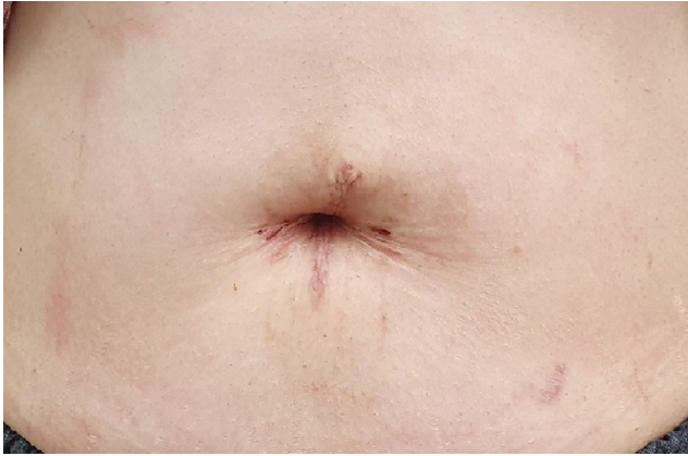
Fig. 5. Follow-up image on postoperative day 30.

could be reduced, thereby diminishing the tension. Using this simple suture method with Vicryl 4-0 and Vicryl 5-0, we performed skin suturing of the subcutaneous tissue and dermal layer using 5-0 nylon. For pressure dressing, we applied a negative-pressure wound therapy device (PICO; Smith and Nephew Co, Watford, UK) and maintained the dressing for 3 days.