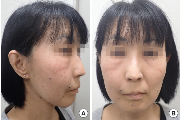
Fig. 3. Postoperative results. There was no swelling of the right mandible of the patient at 1 year and 3 months after the operation. (A) Profile view and (B) frontal view.