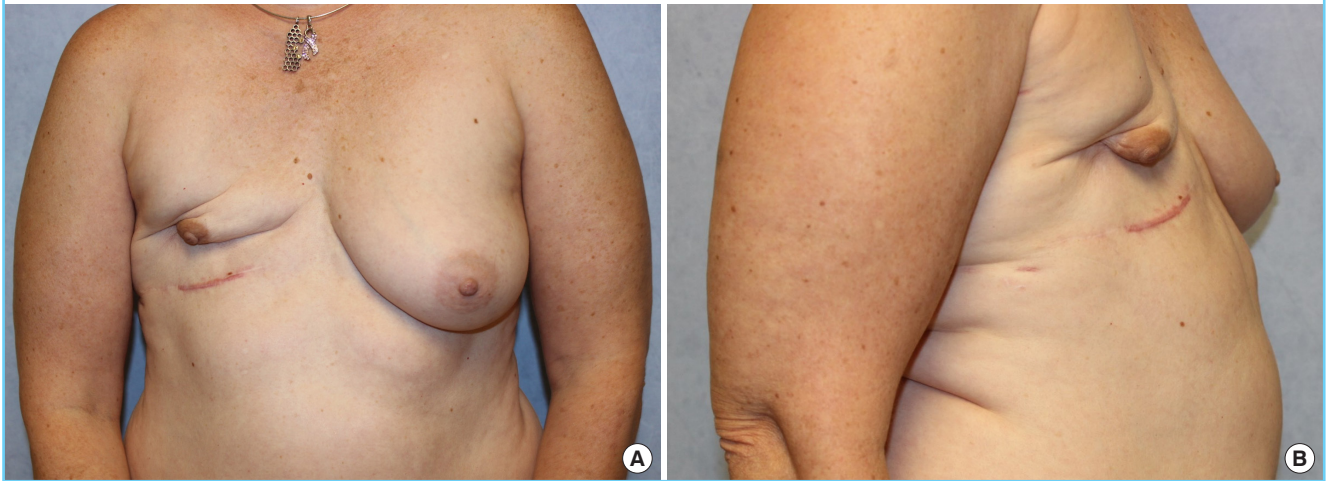
Fig. 3. Delayed breast reconstruction using stacked DIEP flaps

Clinical photographs demonstrating the patient's asymmetric chest after explantation of tissue expander with a magnetic infusion port. (A) Front view. (B) Side view.