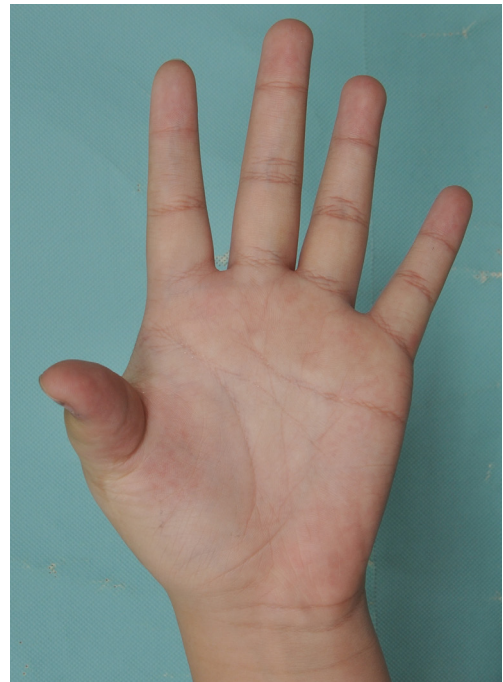
Fig. 2. Preoperative photograph. Radial deviation, unstable metacarpophalangeal abduction, first web space narrowing, and scar contracture were found after polydactyly reconstruction. The patient showed limited abduction and extension of the metacarpophalangeal joint of the left thumb.

The reoperation rates for deformity correction after corrective surgery for polydactyly have been reported to be between 12% and 26% [1,2]. In our literature review, no reports were found of a simultaneous secondary revision operation and fracture fixation in a polydactyly patient after trauma. We report the treatment of a 13-year-old boy via simultaneous secondary corrective osteotomy, first web space release, scar release, and fracture fixation, with an acceptable result.