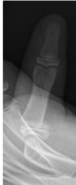
Fig. 1. Preoperative X-ray view. A simple anteroposterior X-ray of the thumb revealed a fracture in the proximal metacarpal with physeal separation of the left thumb metacarpal bone (Salter-Harris type II). In addition, subluxation of the metacarpophalangeal joint of the left thumb was observed.