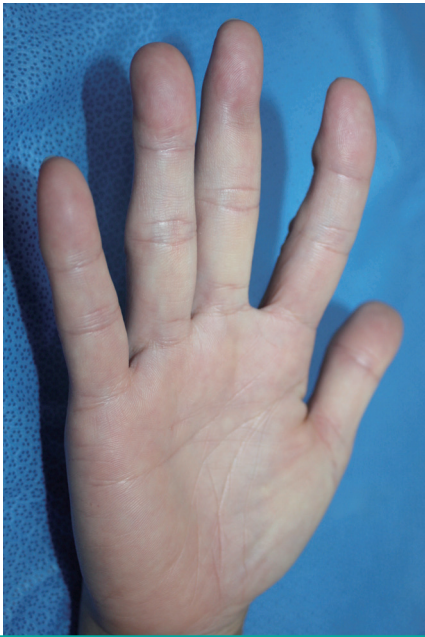
Fig. 4. Case 1: clinical photograph (motion)

Slight depression in the previous defect site was observed on the volar side of the right third finger.