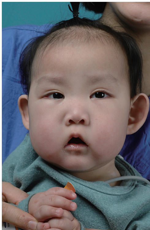
Fig. 2. Twenty-month-old girl with Kabuki syndrome. She underwent two-flap palatoplasty for incomplete cleft palate.

Cardiovascular anomalies are known to affect approximately 50% of the patients with Kabuki syndrome [4]. In contrast, a notable finding in this series is that every patient has a history of congenital cardiac defects with varying severity from a simple atrial septal defect that does not necessitate surgical