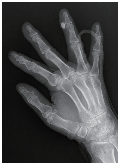
Fig. 1. The initial radiographs showed an ovoid calcification on the radial collateral ligament of the distal interphalangeal joint of the left fourth finger.

Acute calcific tendinitis is a form of acute inflammation of the tendon, causing severe pain, swelling, and limited joint motion, and is characterized by radiologic evidence of periarticular calcification. The pathogenesis is not clear, but some