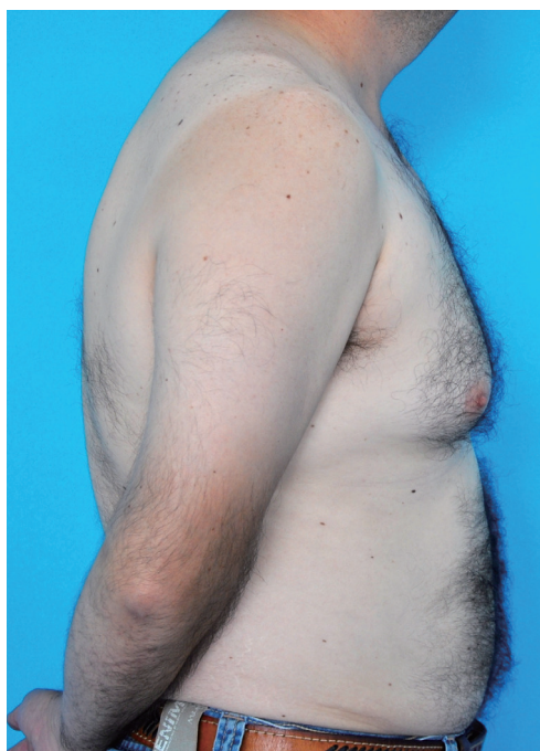
Fig. 1. Preoperative photograph with evident breast enlargement.

The histopathological analysis reported several samples in which stromal fibrosis with hyaline parts was found. Irregular ductal structures were identified, inlaid with hyperplastic epithelium following a