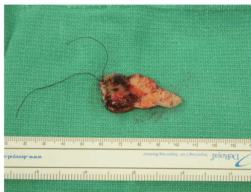
Fig. 2. A 4.7 × 1.8 × 0.4-cm oval, elevated lesion is seen, with an area of focal black pigmentation measuring 1.4 × 1.5 cm.