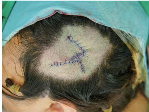
Fig. 3. Postoperative view. The defect was reconstructed using a transpositional flap and primary closure.