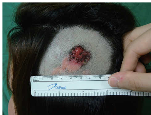
Fig. 1. Preoperative appearance. A papillary erythematous mass arose within a yellowish verrucous nevus sebaceous on the left parietal scalp.

Malignant trichoblastoma is a rare malignant adnexal tumor originating from the hair germ cells. Malignant changes in trichoblastoma may be related to its epithelial component (trichoblastic carcinoma), stromal component (trichoblastic sarcoma), or both (trichoblastic carcinosarcoma). Trichoblastic carcinoma usually presents on the scalp and face in