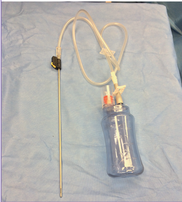
Fig. 2. Harvest of fat whilst the drainage system is closed

Closed suction drainage system connected to harvesting cannula.