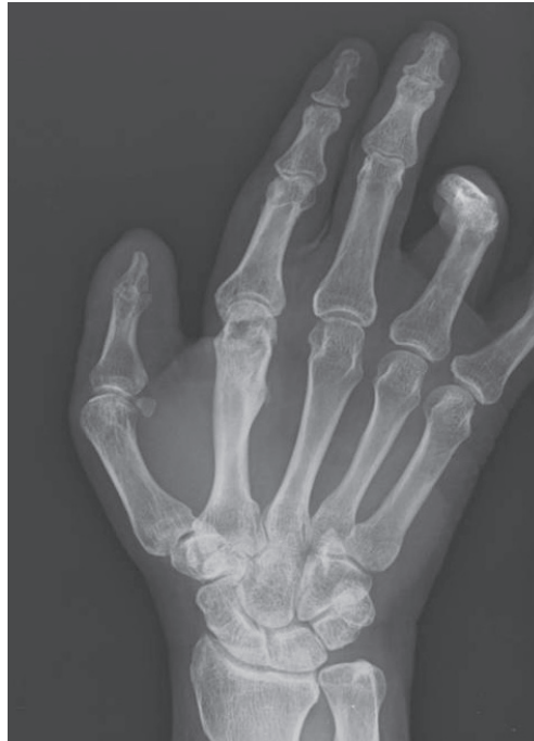
Fig. 3. After six months, no evidence of recurrence was present in a simple postoperative radiograph.

According to a review of the literature, it is very rare for epidermal inclusion cysts to occur in the joint. Strauchen and Strefling [4] reported a case of an epidermal inclusion cyst occurring after arthroscopic surgery in the knee joint. However, this case occurred in the knee joint. To the best of our knowledge, no cases of epidermal inclusion cysts occurring in the interphalangeal joint have been described.