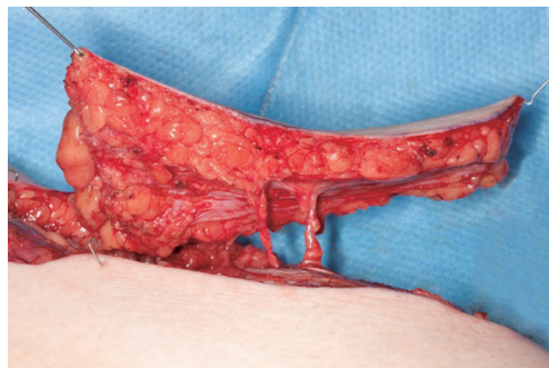
Fig. 3. Two median sural artery perforators were identified and dissected on the lateral aspect of the flap.