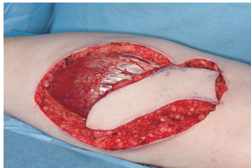
Fig. 4. V-Y flap raised subfascially and advanced into defect.

thickness. The resulting defect was 5 cm × 5.5 cm (Fig. 1). Handheld Doppler was used to locate and mark the perforators preoperatively across the medial head of gastrocnemius. Although more accurate methods can be used to map the perforator, handheld Doppler offers time efficiency and reduces input from radiological investigations [4]. Flap harvest commenced with an incision placed above the medial border of the medial head of the gastrocnemius. A branch of the long saphenous vein superficial to the fascia was encountered and preserved and seen to enter the medial side flap (Fig. 2). Two perforators were identified. The vein was mobilized free from the lateral skin flap to provide enough mobility for flap advancement. The flap was raised subfascially from distal to proximal with identification and preservation of two MSAP (Fig. 3). The two perforators were skeletonised with minimal intra-muscular dissection.