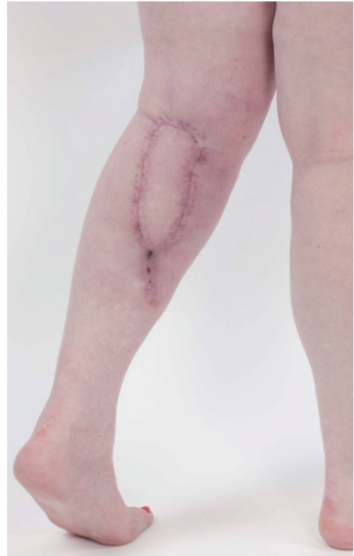
Fig. 5. Medial sural artery perforator flap 4 months postoperatively.

thickness. The resulting defect was 5 cm × 5.5 cm (Fig. 1). Handheld Doppler was used to locate and mark the perforators preoperatively across the medial head of gastrocnemius. Although more accurate methods can be used to map the perforator, handheld Doppler offers time efficiency and reduces input from radiological investigations [4]. Flap harvest commenced with an incision placed above the medial border of the medial head of the gastrocnemius. A branch of the long saphenous vein superficial to the fascia was encountered and preserved and seen to enter the medial side flap (Fig. 2). Two perforators were identified. The vein was mobilized free from the lateral skin flap to provide enough mobility for flap advancement. The flap was raised subfascially from distal to proximal with identification and preservation of two MSAP (Fig. 3). The two perforators were skeletonised with minimal intra-muscular dissection.