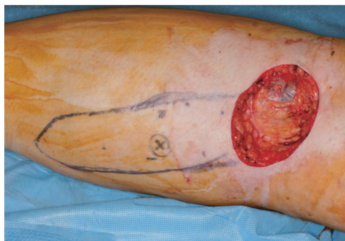
Fig. 1. Wide local excision of malignant melanoma left popliteal fossa with resulting 5 cm × 5.5 cm defect. V-Y advancement flap designed based on a dominant perforator marked with an X.

Use of the pedicled medial sural artery perforator (MSAP) fasciocutaneous flap has been widely reported in the literature for ipsilateral lower limb reconstruction. Depending on defect location, the MSAP flap may be utilized as a propeller or V-Y advancement flap [1]. This perforator flap is typically based on the proximal perforator of the medial sural artery supplying the gastrocnemius muscle. One of the main issues encountered when performing an MSAP flap is venous congestion [2], a commonly described complication in other perforator based flaps [3]. We describe a useful technique to overcome this problem by including the superficial vein into the original flap design. A 57-year-old woman was referred to our department with a malignant melanoma in the left popliteal fossa. Histologically the lesion was reported as having a 0.8 mm Breslow