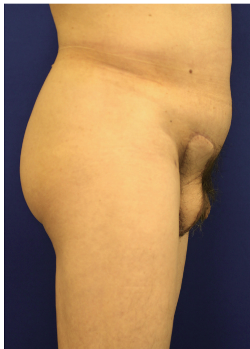
Fig. 5. This figure contains a lateral view three months after the operation showing that the wounds had healed well and that a good aesthetic result was achieved.

Second, by choosing the pedicled ORAM flap over the pedicled ALT flap, we were able to raise the ORAM flap simultaneously on the contralateral side