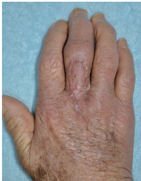
Fig. 3. A second operation (full-thickness skin graft) was performed, and, three months postoperatively, there was no evidence of recurrence.

cultured, and a biopsy should be performed [2]. If Fusarium species are identified in culture or biopsy, aggressive debridement should be performed and antifungal therapy should be administered. Previous guidelines recommended amphotericin B for treatment of fungal infections, including Fusarium infection, however, in a recent analysis, voriconazole was recommended as the most cost-effective therapy [4]. Treatment of cutaneous fusariosis is usually successful. Determination of the endpoint of antifungal treatment should be made by serial tissue cultures and biopsies, until there is no growth in culture and no fungal hyphae in a biopsy.