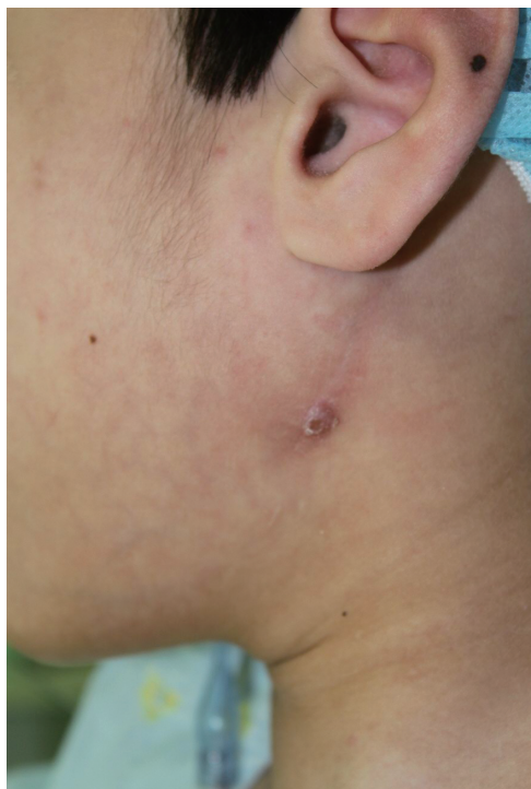
Fig. 1. Preoperative view of the mass.

According to research reported by Laughlin et al. [5], neither infection rate nor revision rate was higher for patients with a mandible fracture who underwent an operation using an absorbable plate, compared to metal fixation. Out of 50 patients with a mandible fracture, 6% had infection, 4% with hardware removal. In the control group described in the review article, out of 617 patients, 3.9% had nonunion/fibrous union, 13% with infection, and 18.9% had hardware removal. Accordingly, regular follow up is essential for use of absorbable fixators in patients. Infection is the most important and considerable