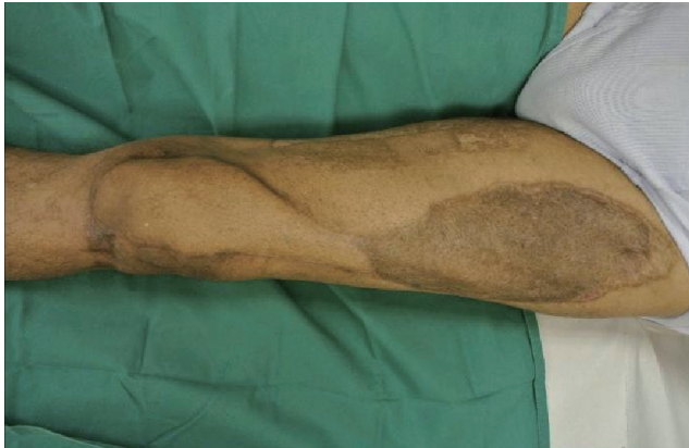
Fig. 4. At two year follow-up the defect has been closed with little overlying tension and minimal scarring allowing for acceptable range of movement. Minor scar revision of the dog-ear over the pivot point of the flap had been done.

into a short “handle”. This was a full-thickness skin bridge at the pivot point where the proximal flap was rotated 180 degrees downward towards the recipient site. The bridge acted to offer cutaneous and subcutaneous continuity and maintained an intact subdermal plexus to serve as additional channel for venous drainage [2]. After the flap was transposed to the knee, a vein graft was utilised to connect the descending femoral circumflex vein to the great saphenous to further augment drainage [3].