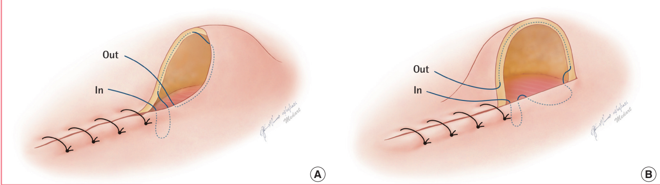
Fig. 2. Case 1, standing full-cone dog ear

(A) The three-bite technique applied on the standing full-cone dog ear. (B) The three-bite technique applied on the half lying-cone dog ear.