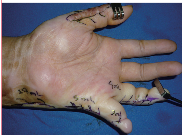
Fig. 2. A totally bloodless operative field

Operative field 19 in patient 5 consisted of three operative fields on the right hand. The three operative fields were located adjacent to one another, resulting in the confluence of injections. Thus, the three operative fields were ultimately characterized as a single operative field with regard to the assessment of operative field clarity.