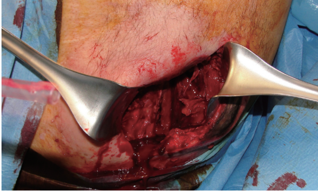
Fig. 3. Intraoperative view: drainage and surgical debridement have been performed.