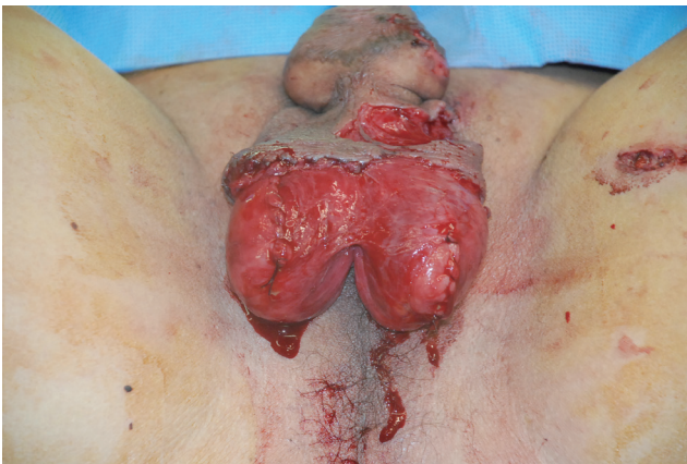
Fig. 4. Preoperative photograph of case 2. The defect size was 10 × 9 cm. The lower two-thirds of both testes were exposed.

coverage of the defect with bilateral flaps, donor site closure could be achieved by primary intention.