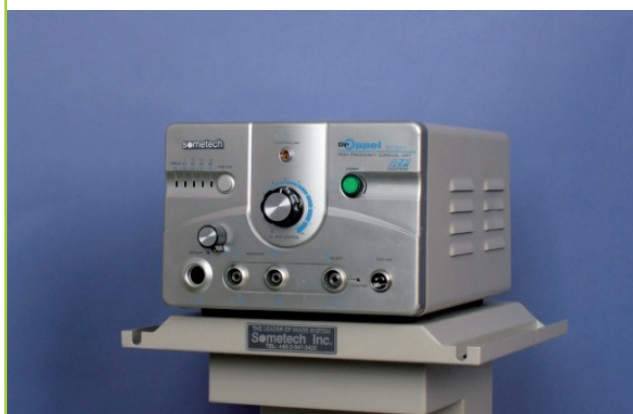
Fig. 2. Surgical tool

The radiofrequency surgical unit (4 MHz radiofrequency Dr. Oppel ST-501).