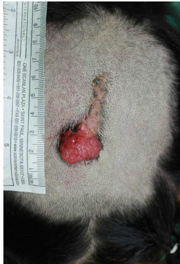
Fig. 1. Preoperative view. A papillary erythematous mass of nevus sebaceous on the scalp.

In the erythematous mass containing the nevus sebaceous, a wide excision was performed with a safety margin of 5 mm. A frozen section biopsy showed that there were no tumor cells on the resection margin. Following the resection, scalp defects of 2.5 × 5.0 cm in size remained (Fig. 2). The defects were reconstructed using a scalp rotational flap and primary closure (Fig. 3). A histopathologic examination of the resected erythematous mass was performed, and it revealed the presence of irregular lobules of varying size with a well-defined margin from the adjacent interstitial tissue in the dermis. In the center of each lobule, there were non-typical cells with a foamy cytoplasm and undifferentiated cells. This was indica-