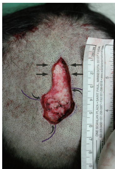
Fig. 2. Intraoperative view. Wide excision involving a 5-mm safety margin. Three separate rotation flaps equally positioned around the defect, raised and pivoted in the same direction.