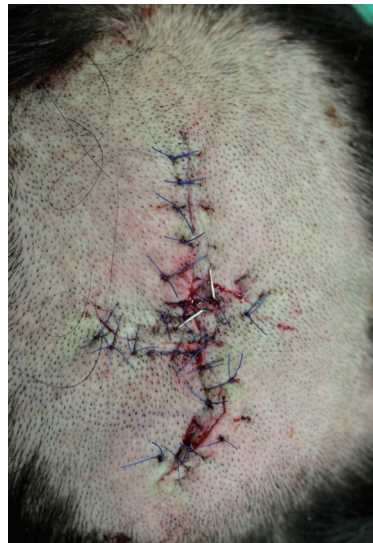
Fig. 3. Postoperative view. The reconstruction of the defect using a rotational flap and primary closure.

The current case is a relatively young patient who presented with both benign and malignant tumors, showing sebaceous differentiation, as well as the nevus sebaceous. The patient was tentatively diagnosed with Muir-Torre syndrome. A gastrofiberscopy, a colonofiberscopy, and an abdominopelvic computed tomography were therefore performed to search for gastrointestinal and urologic tumors, but no underlying malignancies were found. The patient was followed for 2 years after the operation with no recurrent episodes and no occurrence of internal malignancies.