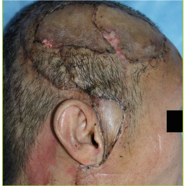
Fig. 5. Photograph 10 months postoperatively

All flaps survived well and the skin graft was successful. In addition, there were no further signs of infection.