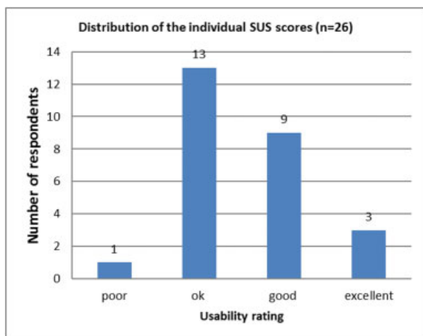
Fig. 3 Distribution of the individual System Usability Scale (SUS) scores ( N = 26 ).

About 70% of the respondents preferred to have additional information about the application of statistical methods or tests; 57.7% of the researchers would prefer the display of additional information about specific options/parameters. Almost all participants require additional functionalities, in particular a link to the patient record (76% fully/rather agree), a link to external gene databases (92.3% fully/rather agree), and a link to external network/path databases (84.6% fully/rather agree).