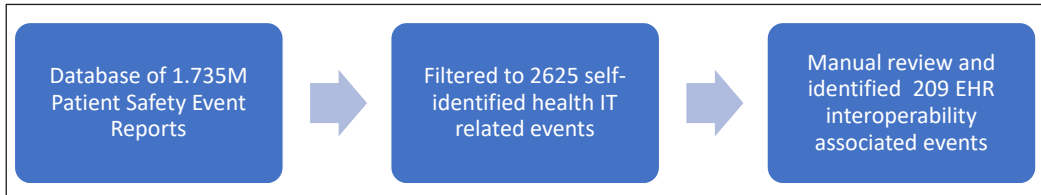
Fig. 1 Overview of the process to identify EHR interoperability related safety events.