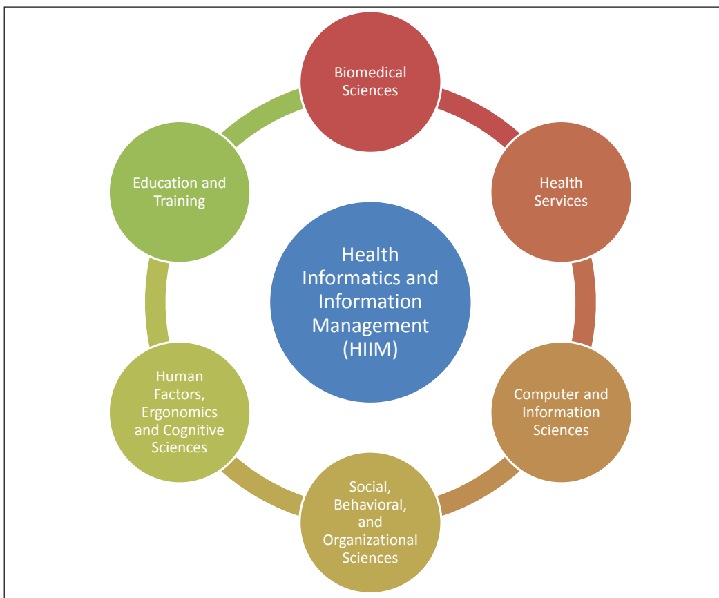
Fig. 2 Six major competency domains in health informatics and information management.