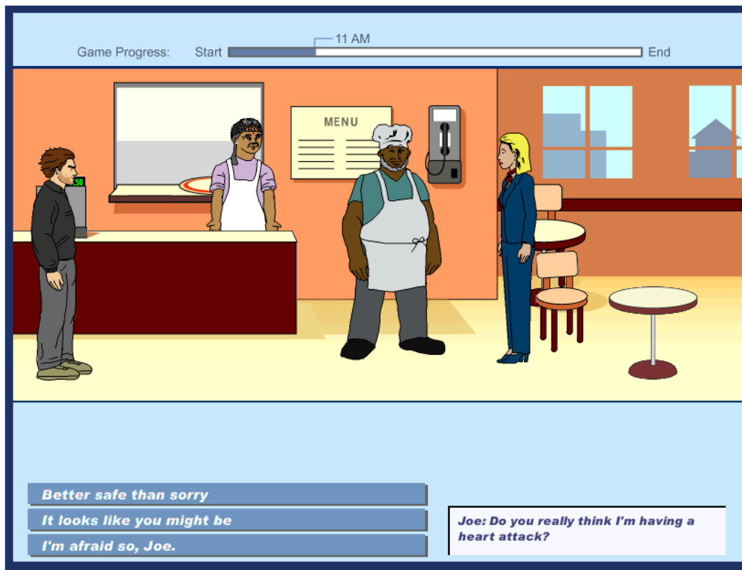
Fig. 2 Scene from the game "Heart Sense" for heart attack prevention with possible replies [23].