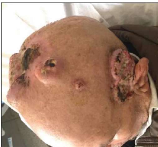
Figure 1: Multiple nodules on the scalp in the parietal and left temporal region

After the third cycle of chemotherapy, the scalp metastases increased in number and extended.