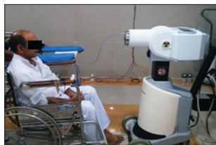
Figure 2: Patient with a catheter in airway during treatment on high-dose-rate-microselecron

three fractions once a week in the study done by Speiser and Spratling. [15]