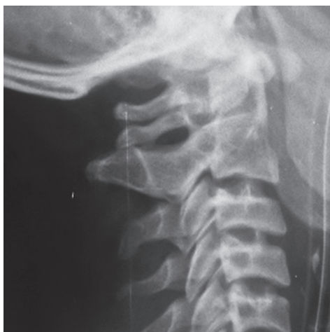
Figure 1: X-ray cervical spine showing two C1 posterior arches