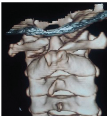
Figure 3: Three-dimensional computed tomography reconstruction of C1/C2 complex