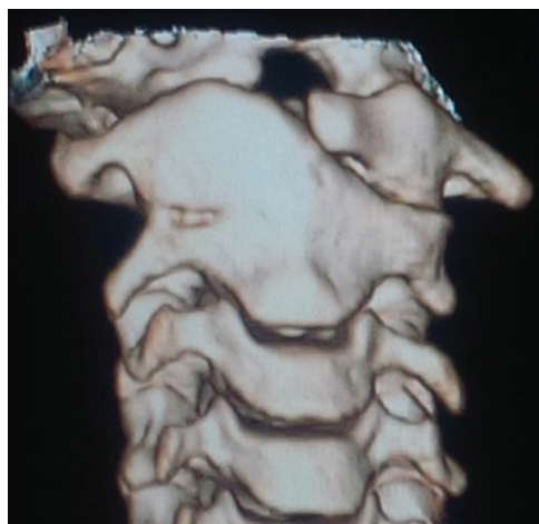
Figure 4: Dens fused to right half of C1 arch