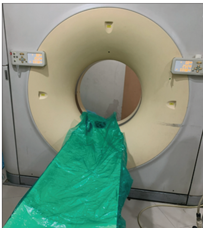
Figure 3: CT scan couch is covered with plastic polyethene when suspected or proven COVID-19 patient

and new norms of social distancing. These are new things which the diagnostic center must follow so that it's "better to be safe" and thus aid in preventing cross transmission of infection in the COVID-19 pandemic.