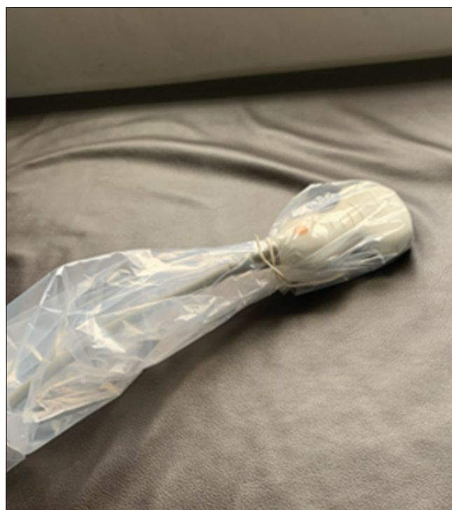
Figure 2: Ultrasound probe is covered plastic polyethene when suspected or proven COVID-19 patient

damaged, do not continue using them. They need to be replaced