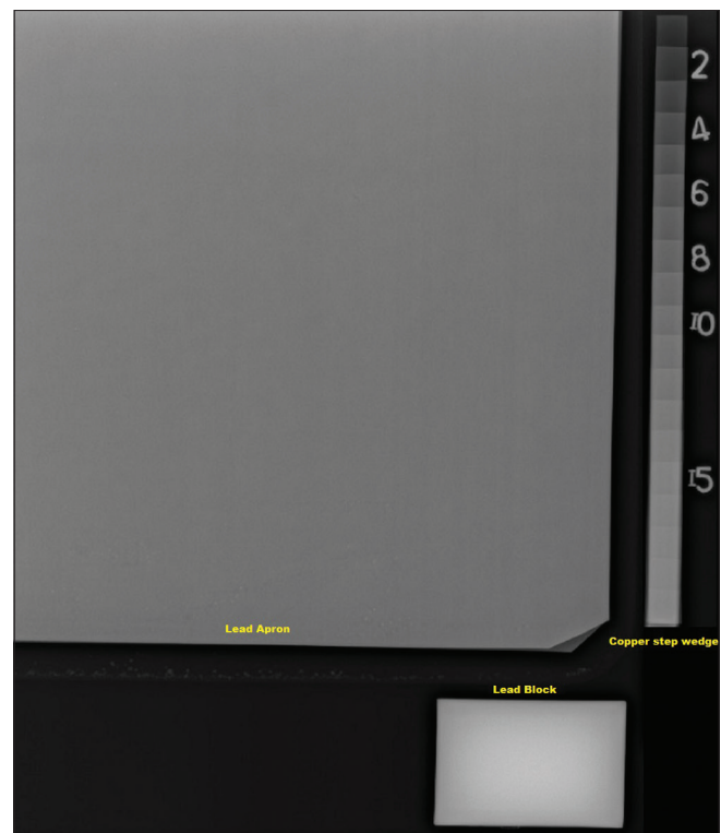
Figure 1: Experimental set-up with apron, copper step wedge, and 2 mm lead block placed adjacent to each other

A copper step wedge (19 steps) with 0.2 mm thickness progressively increasing with every step and a 2 mm thick reference lead block was placed adjacent to the apron in order to monitor the pixel intensity [Figure 1]. Standard radiographic exposure factors with tube potential of 100 kVp and tube load of 5 mAs was used to study the pixel intensities from the Pbeq apron and the corresponding pixel intensity from the step wedge. Extremity radiography is a non-grid technique and hence this was used as a default setting during the study. This technique is independent of any preset protocol; however, due to the changes in the histogram and the postprocessing in different presets given by different vendors, this study would be reproducible if the same preset protocols are followed. The reference 2 mm lead block was used to monitor the consistency of the pixel intensity measurement for the standardized X-ray output. Mean pixel intensities were measured by placing the region of interest (ROI) on a homogeneous part the apron, step wedge, and lead block using the software available in the GE Centricity PACS workstation (Milwaukee, USA). The mean pixel intensity from the apron was matched with corresponding step (thickness of copper) from step wedge to monitor lead equivalence. The pixel value ratio (PVR) was calculated from mean pixel intensity of the apron and the lead block and lead block versus Cu step wedge.