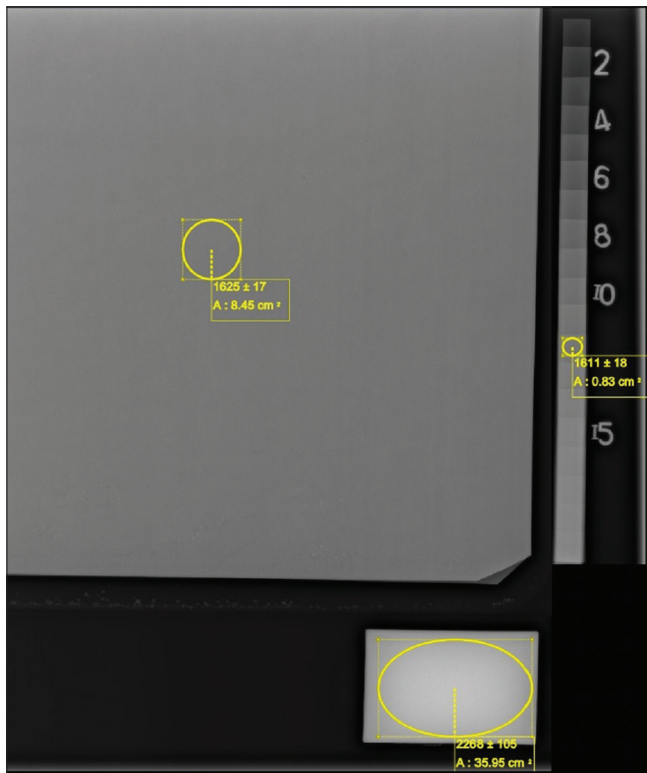
Figure 4: Regions of interest showing pixel intensities of apron, step wedge, and lead block from digital radiographic images