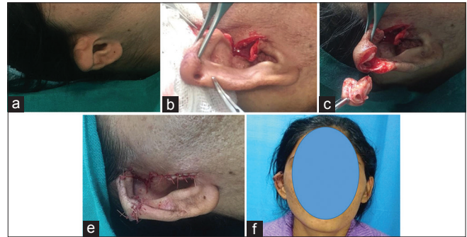
Figure 2: (a) Pre-operative cup deformity (b) sinus with pit (c) excision of cyst and correction of deformity (d) immediate post-operative picture (e) 6-month follow-up