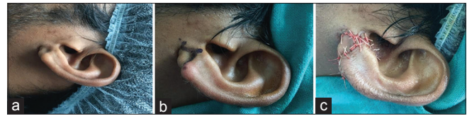
Figure 1: (a) Pre-operative wavy lobule deformity (b) surgical planning (c) post-operative photograph

They can be genetic (syndromic, [3] non-syndromic, positive family history or spontaneous mutations) or acquired in