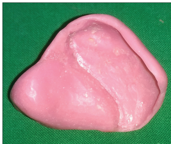
Figure 2: Custom tray obtained by duplicating the existing prosthesis