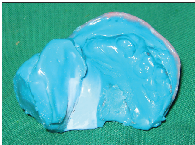
Figure 3: Definitive elastomeric impression