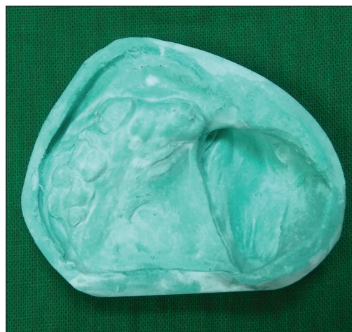
Figure 4: Master cast