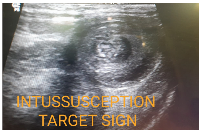
Figure 1: Ultrasound imaging showing loop within loop picture (target sign) suggestive of intussusception

During surgery, several multicentric intramural masses involving the bowel circumference variably were seen to involve both jejunum and ileum [Figure 2a]. The proximal-most lesion among them was the lead point to jejunojejunal intussusception [Figure 2b] which could be reduced manually. Resection was not done due to diffuse involvement of the entire small bowel. One of the enlarged mesenteric lymph nodal masses was excised and sent for histopathological examination (HPE). HPE revealed features of high-grade B-cell non-Hodgkin's lymphoma which was positive for CD20, CD10, and BCL6 and showed high Ki-67 positivity; fluorescence in situ hybridization study showed a c-MYC translocation suggesting Burkitt's lymphoma [Figure 3].