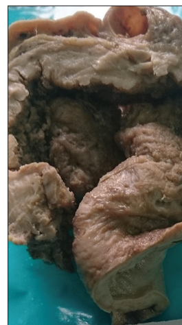
Figure 2: Gross picture of right-sided ovary showing borderline serous cystadenoma with endometriosis