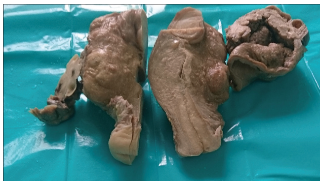
Figure 1: Gross examination of hysterectomy showing subserosal and intramural leiomyoma, whereas right-sided ovary having borderline serous cystadenoma with endometriosis