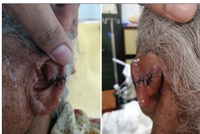
Figure 2: Postoperative images after excisional biopsy of verrucous growth over the helix of the left pinna