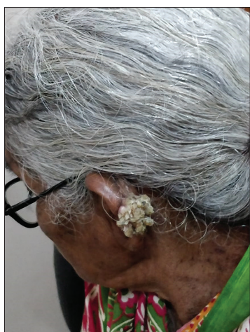
Figure 1: Cauliflower-like growth presents on the helix of the left pinna