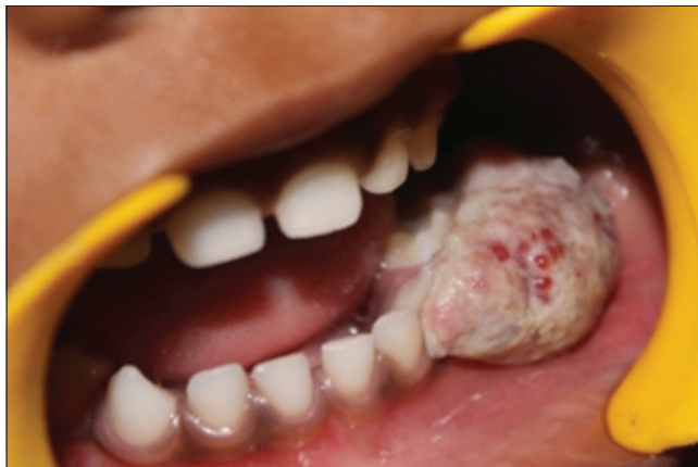
Figure 1: Exophytic growth was seen arising from gingiva in relation to 73, 74, and 75 tooth region

Hullihen's description in 1844 was most likely the first PG reported in English literature, but the term “pyogenic granuloma” or “granuloma pyogenicum” was introduced by Hartzell in 1904. [6] The incidence of PG is 19.76%–25% of all reactive lesions. [7] Although it has been reported in all age groups, higher frequency of PG is observed in the second decade of life, especially among women, probably because of the vascular effects of female hormones. [8] In the pediatric age group, this tumor occurs most frequently in early childhood. The present case was in a 4-year-old female patient in early childhood, where at this age group, PG is very rare and makes the report unique. PG of the gingiva develops in up to 5% of pregnancies. Clinically, PGs usually present as painless, soft in consistency, pedunculated or sessile, smooth, or lobulated surface red-to-purple masses.