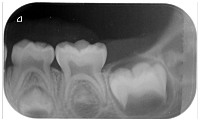
Figure 2: Intraoral periapical radiograph showing soft-tissue shadow in relation to 74 and 75

Vilman et al. observed that gingival cases show a much higher recurrence rate than lesions from other oral mucosal sites. [10] Sapp et al. stated that oral PGs have a relatively high rate of recurrence after simple excision. If the patient is pregnant, recurrence is common. Recurrence after surgery in extrajingival sites is uncommon. [11] The present reported case was followed up for 1 year with no incidence of recurrence.