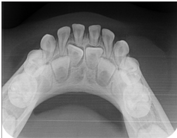
Figure 3: Occlusal radiograph showing soft-tissue shadow in relation to 73, 74, and 75

LCH most commonly appears as sessile lesion whereas non-LCH PG appears as pedunculated lesions. The lesion commonly ulcerates and bleeds profusely. It varies in size from a few millimeters to several centimeters and rarely exceeds 2.5 cm. The consistency of the lesion gets firmer both with aging of the lesion and removal of its etiological factors. Surgical excision is the treatment of choice for PG. Although these are reactive hyperplasias, they have a relatively high recurrence rate of 16% after simple excision, whereas recurrences after surgery of extrajingival PGs are, however, uncommon. Elimination of the causative agent is required. Radiographic findings are absent in PG. However, Angelopoulos AP in his review observed that localized alveolar bone resorption in rare instances of large and long-standing gingival tumors can be seen, [9] but in our reported case, mild interdental vertical bone loss was observed and associated with a soft-tissue shadows of the gingival overgrowth on IOPA and occlusal radiographs on the affected side.