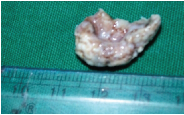
Figure 5: Excised surgical specimen