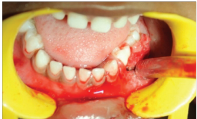
Figure 4: Postoperative surgical excision site