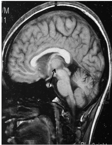
Figure 1: Magnetic resonance imaging T1-weighted contrast image of sagittal section showing a heterogeneously enhancing mass below the splenium of corpus callosum invaginating into the posterior 3 rd ventricle compressing tectal plate inferiorly and compromising cerebral aqueduct likely a pineal mass measuring 50 mm × 28 mm × 24 mm in maximum anteroposterior, cephalocaudal, and lateral dimensions, respectively

acidic protein (GFAP), and epithelial membrane antigen [Figure 2c-i]. The tumor cells were negative for chromogranin-A, neurofilament protein, CK7, CK20, and CK5/6. A MIB-1 labeling index of 2%–3% was noted. On electron microscopy, these cells delineated microvilli and cilia similar to ependymoma, which confirmed their origin from the SCO of the pineal region [Figure 3a-b].