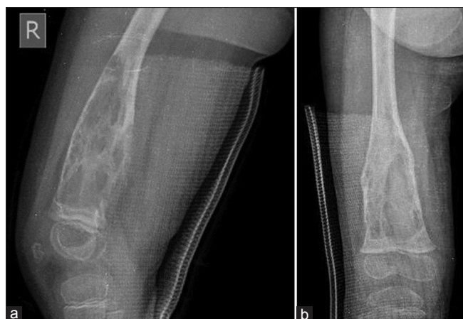
Figure 1: X-ray shows an irregular lytic lesion involving the distal metadiaphyseal region of the right femur (a) lateral view (b) anteroposterior view