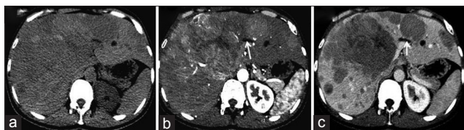
Figure 1: Axial images of multiphase computed tomography scan of the upper abdomen revealed multiple hypodense lesions of variable size involving both lobe of the liver (a), Which shows hyperenhancement in hepatic arterial phase (b) and washout in subsequent portal venous phase (c). One of the large central mass is having central nonenhancing area suggestive of necrosis and also causing mild dilatation of the left hepatic duct (white arrows)

Melanoma cells as compared to normal melanocytes. The liver is the only organ that highly expresses the corresponding ligands of these receptors (HGF, IGF, and CXCL12), indicating that these pathways may be highly involved in the liver-specific metastases in Uveal melanoma. [2]