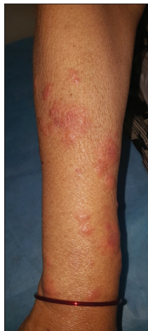
Figure 1: Multiple shiny, edematous, erythematous 0.3 cm × 0.3 cm to 3 cm × 3 cm sized soft papules and plaques involving right forearm

A 4 mm punch biopsy from a lesion showed marked papillary dermal edema with a predominantly interstitial and mild perivascular infiltrate of predominantly histiocytoid mononuclear cells and lymphocytes along with some karyorrhectic debris [Figure 2a and b]. These histiocytoid cells had a large vesicular nucleus with conspicuous nucleoli and pale abundant cytoplasm. Neutrophils were absent in the infiltrate. The histiocytoid cells showed occasional mitotic figures and were immunopositive for CD68, MPO, lysozyme, and CD 15 and negative for CD117 and CD34 [Figure 3a-f]. Leukemia cutis was ruled out, as no blast cells were seen. A diagnosis of HSS was made. We did not consider possibility of vasculitis due to the lack of fibrinoid necrosis, extravasation of erythrocytes, and prominent angiocentric infiltrate. PNGD was also ruled out due to the absence of a combination of leukocytoclastic vasculitis and interstitial and palisaded infiltrate of histiocytes/granulomas.