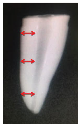
Figure 1: Peri-radiographic showing the dentinal wall width of a sample

The average baseline pH in control group was similar (pH 6.9–7.4). The pH values of both \text{Ca(OH)}_2 was between 9.2 and 11.2 when measured in all the