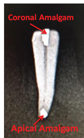
Figure 2: Peri-radiographic showing a sample from control group