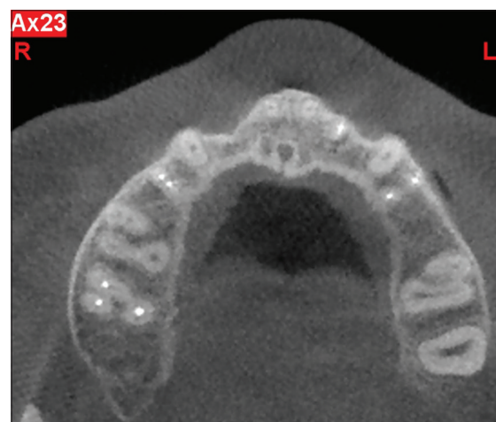
Figure 1: Axial cone beam computed tomography view shows two distinct canals in the mesiobuccal root of the maxillary right first molar tooth

Axial and cross-sectional CBCT views with 1-mm slice thickness and 1-mm slice interval were evaluated by scrolling the images from the pulp chamber to the apex for each first and second molar tooth [Figures 1 and 2]. Two maxillofacial radiologists individually evaluated the CBCT images. Presence of MB2 canal within the MB roots of maxillary first and second molar teeth was assessed. Root canal configuration was determined according to the classification of Weine [19] which describes the root canal types as follows: Type I – a root canal extending from the pulp chamber to the apex, Type II – two root canals that connect near the apex, Type III – two root canals leading to two distinct apical foramens, and Type IV – a root canal that is divided into two canals and ends at two distinct apical foramens. In addition to determining the number and shape of the MB root canals of the maxillary first and second molars, the relationship between the number of canals and patients' sex as well as the buccopalatal dimension of the MB roots at the level of cemento-enamel junction where the canal orifice begins was evaluated. Chi-square test was used to examine the relationship between the number of MB canals and sex and Mann-Whitney analysis was used to define the relationship between the number of canals and the buccopalatal dimension of the MB