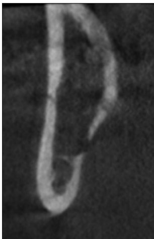
Figure 1: Digital volume tomography with osteosclerotic lesions in the right mandible

In October 2015, a 60-year-old male patient went to see his dentist due to toothache, increasing dysesthesia, and pain of the chin and the right mandible. These symptoms were accompanied by a slight reduction in physical fitness and some dyspnea. The dentist performed a dental cone-beam computed tomography (digital volume tomography), showing osteosclerotic lesions in the right mandible [Figure 1]. For further workup to distinguish infection from malignancy, an MRI of the skull was carried out revealing multifocal bone marrow infiltration in the whole mandible and the left parietal region [Figure 2]. With these findings, the dentist referred the patient to an oncologist.